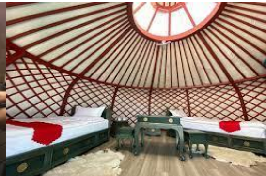
Secret of Silk Road Camp, Kharkhorum