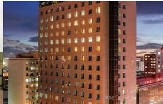
Grand Hill Hotel UB